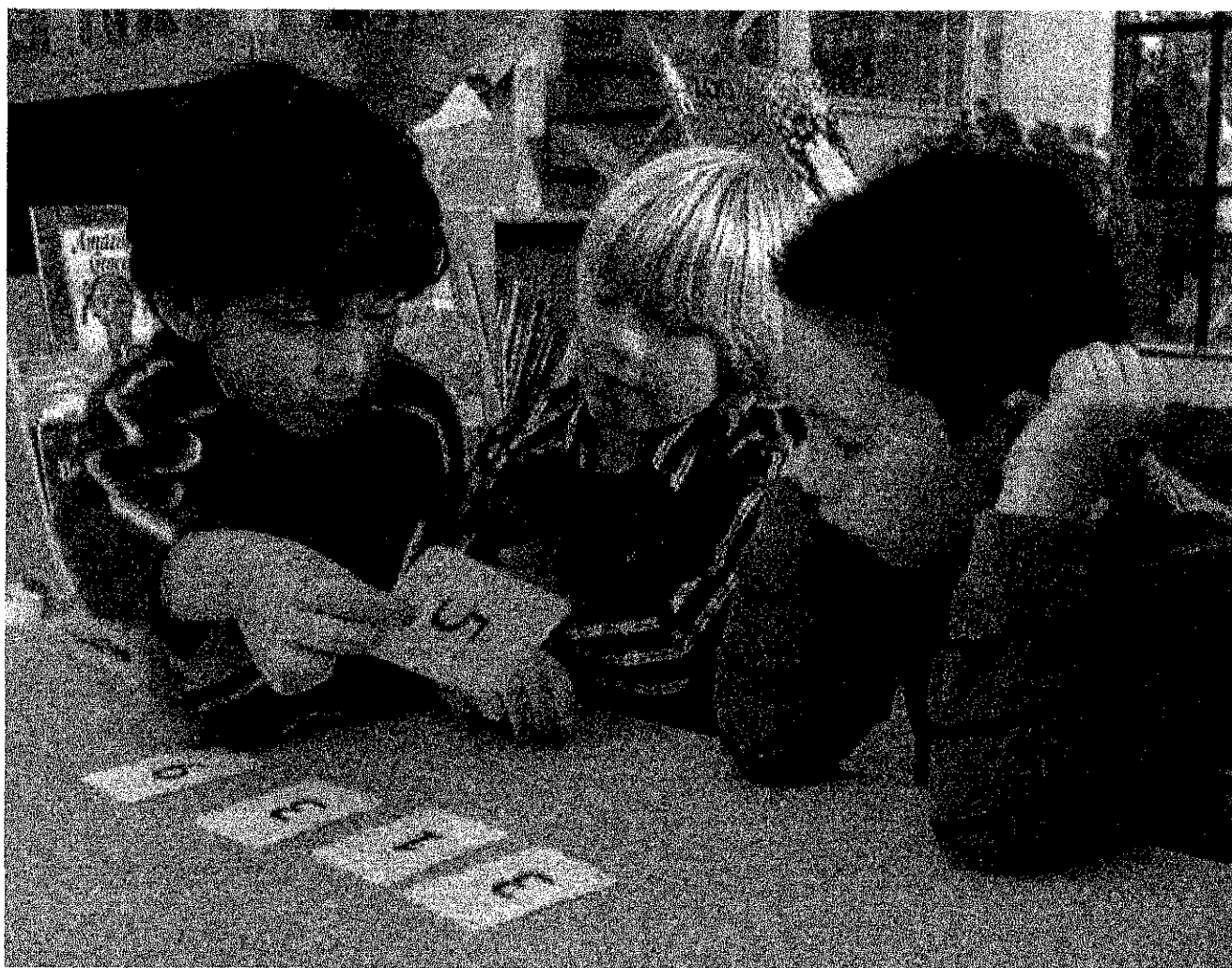
Playing Seven Up: Having students play together in small groups encourages communication while they learn about the numbers that add to 10.

addition.) Then find the sum that came closest to 100 without going over. Post the winning game board and have the others check the addition. With a whole class, it's likely that more than one student will get the same winning sum.